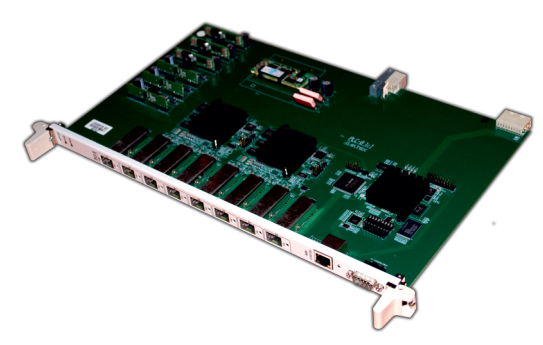
GPON Line Card PLC8