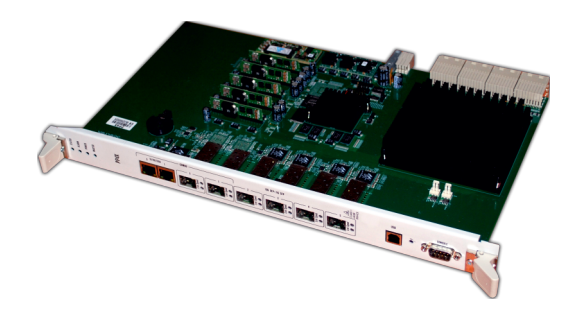
Uplink Controller Card PP4X